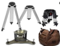
Ronford Baker ATLAS50